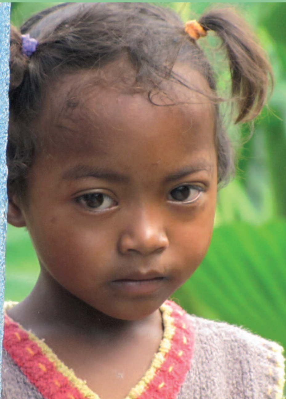
mission MADAGASCAR 2023