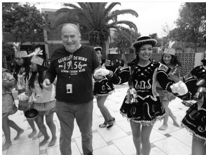
With the children of Puente Piedra in Lima