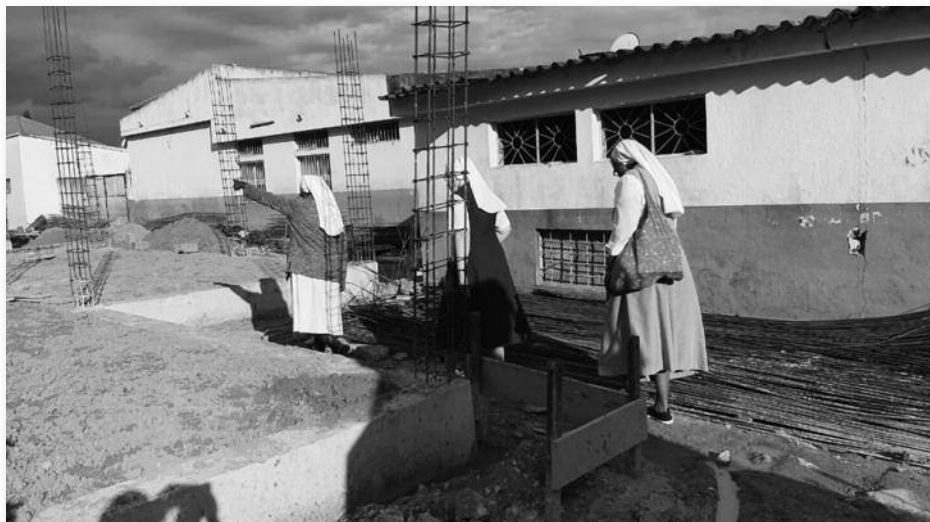
Photos of the construction site supervised by the sisters.