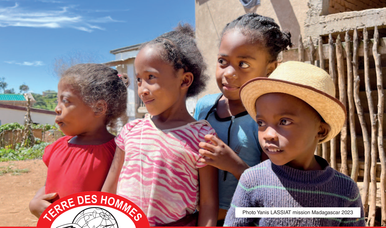
mission Madagascar 2023