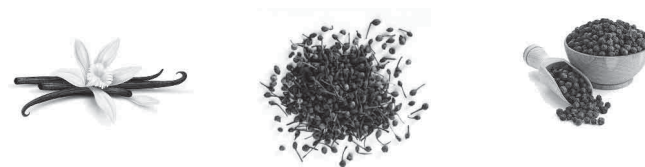
Vanilla and wild pepper from Madagascar and pepper from Brazil

Always a great success with vanilla that we present in tube. This year we will also try vanilla powder.