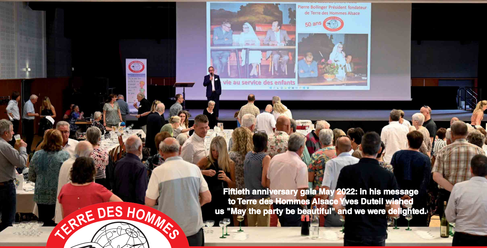
Fiftieth anniversary gala May 2022: in his message to Terre des Hommes Alsace Yves Duteil wished us "May the party be beautiful" and we were delighted.