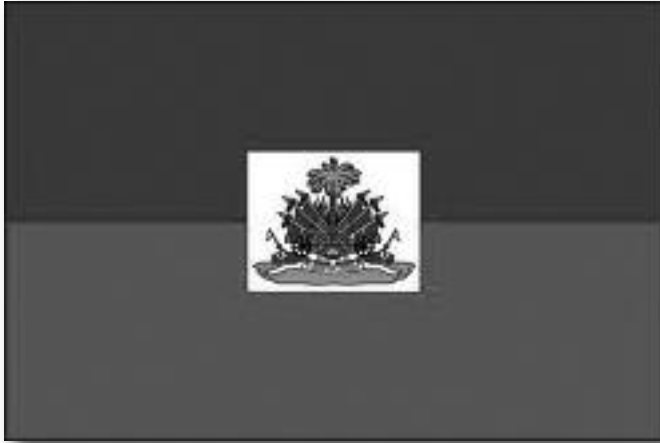
Recent news from Lamielle, Haiti