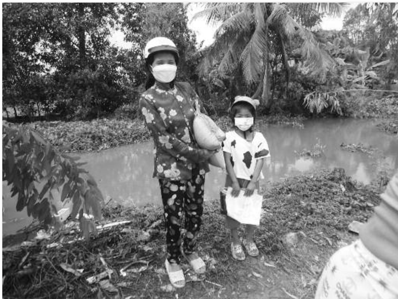
Distribution of 30 bags of rice and 40 shirts (70 children) to schoolchildren in Bui Thi Xuan.

We already discussed this in our previous newsletter.