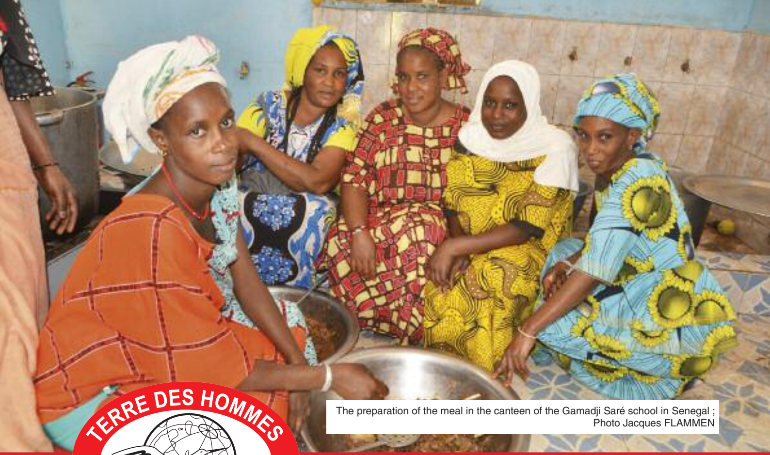
The preparation of the meal in the canteen of the Gamadji Saré school in Senegal