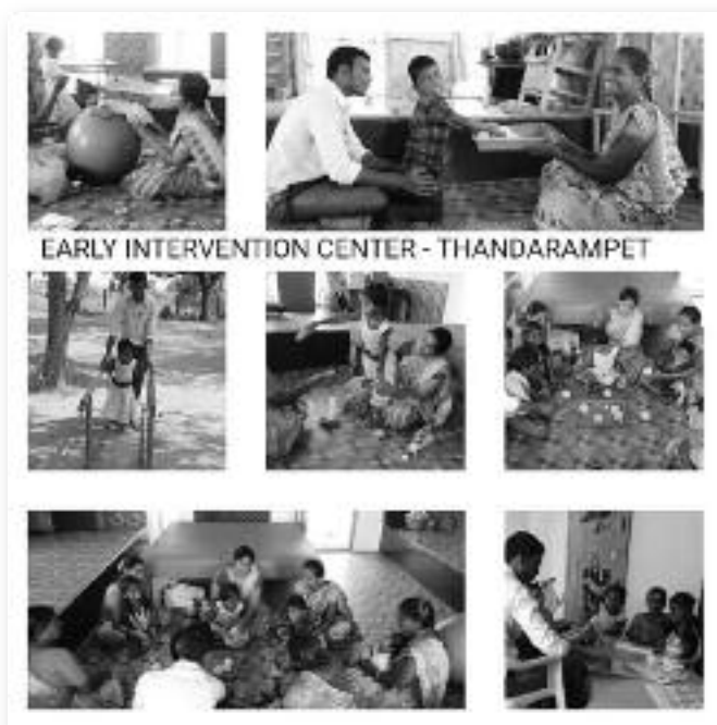
EARLY INTERVENTION CENTER - THANDARAMPET

After a two-year hiatus due to the pandemic, activity can finally resume.