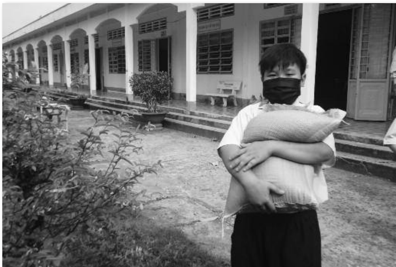
Distribution of 20 bags of rice (20 children) to schoolchildren in Hoang Hoa Tham