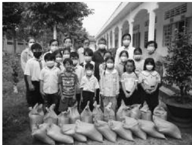
Distribution of 20 bags of rice (20 children) to schoolchildren in Nguyen Binh Khiem